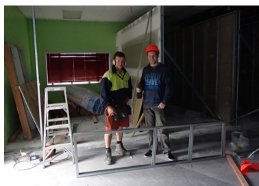
Framing the Budget Advice Centre