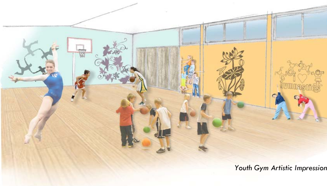
Youth Gym Artistic Impression

A new sense of HOPE and optimism is sweeping our city, as plans & dreams about what a rebuilt city will look like. We're not too interested in the bricks and mortar, but we are interested in the positive youthwork that can be done within bricks and mortar. 2014 is our 25th Birthday and we are at an advanced stage in plans for a purpose built youth & community facility as part of our present building - Grace Vineyard Beach Campus on Seaview Road/Beresford St.