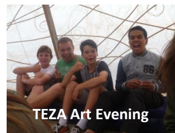
TEZA Art Evening