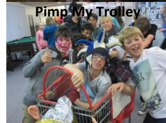
Pimp My Trolley