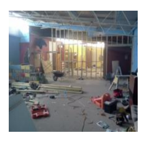
2. After Feb EQ