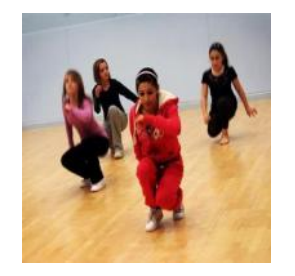
Spring Wooden Floor