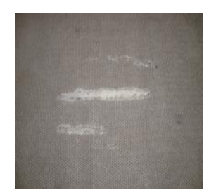
Current example of carpet