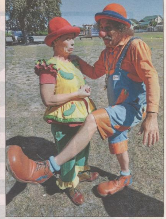
Clowning around: Entertainers having fun.

■ Youth Alive Trust can be contacted on 3885459 or visit www.yat.org.nz