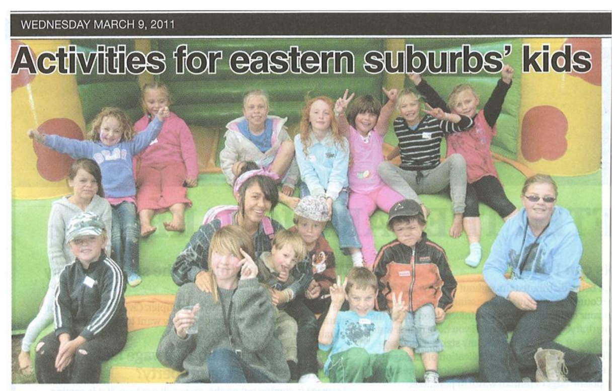
Light relief: Children and volunteers enjoy the bouncy castle at the Youth Alive Trust children's programme in New Brighton.

The Post EQ Childrens Programmes features in numerous media outlets, including TV3 News, Breakfast News, News Talk ZB, Christchurch Mail and Pegasus Bay News. For more footage of the programmes see the links to YouTube on our Website.