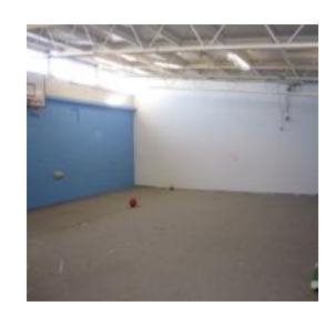
3. Current - rebuilt wall

Our Games Hall has been very well used for the past 20 years and is in need of a 'make-over'! This is the hall all our clubs use for a variety of activities, including ball games, sports, messy games, group activities and challenges. The February EQ made one of the walls unstable, and therefore it had to be demolished and rebuilt. Unfortunately this was our mural wall. The floor is carpet on top of concrete, which currently has rips in it and since the EQ it doesn't feel completely flat. It is a cold room, as the heater that's been used for the past 15 years is very average (and currently not been replaced). The roof has low bearing steel structures, which affect ball games. One corner of the room is dark and cold, and is used only as a storage area. We're proposing a BIG make over, and transforming the hall into the basis of a New Brighton Youth Centre in order to work with more young people, families and the community!