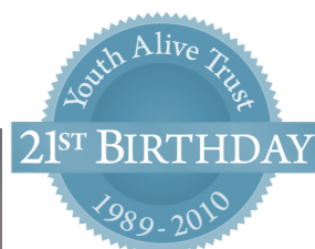
← YAT Trustees

"They (my daughters) have met new people and enjoyed doing all the activities, learning new social and physical skills."