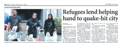
Refugees lend helping hand to quake-hit city

See our Website for full media articles, videos, photos and all the latest news!