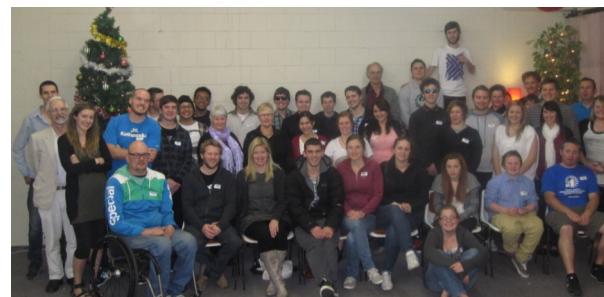
Volunteers Mid-Winter Christmas Dinner & Training