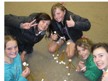
Age 14 as Junior Leader