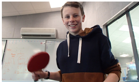
Table Tennis Comp

On Friday afternoons, RCSI organise all our local primary schools to play sport against each other - including the ping pong fanatics who use YAT's 6 new table tennis tables in our new Gym thanks to a CCC Grant.