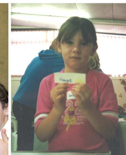
Age 5 on HP's

*What's the value of youthwork? It's having the awesome opportunity to make a difference in someone's life. Whether it be a big or a small thing, being able to help someone is so rewarding. *Best moments as a volunteer? There are too many to count! But if I had to narrow it down it would be when young people approach me outside of clubs - that they feel safe and comfortable enough to chat to me in public, that always makes my day!