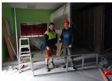
Framing the Budget Advice Centre