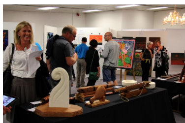
Art Auction - Raised $15,000