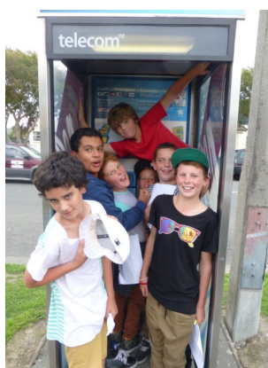
Telephone Box Challenge

include a Youth Gym - large multi purpose hall; high roof, spring wooden floor, Youth Lounge - suitable for drop-in and set up for comfort of young people, Crèche - under 2's & over 2's areas with childrens toilets & kitchen, a Music Room - for learning, practicing & recording musical instruments & bands, Outdoor Play Area , for under 5's, Toilets , Offices for Youthworkers, Budget Advice Centre , Reception , Community Information Noticeboards , Multi Agency Office and upgrading the structural integrity and fire safety of the whole building upto modern standards.