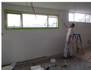
A hint of colour