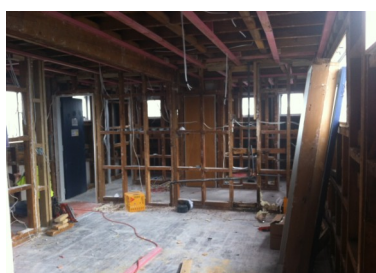
The destroying stage